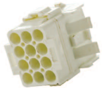
14 Wire-to-Board Connector

For more information about what Vydyne products can do for you, contact your sales representative or visit us at www.ascendmaterials.com .