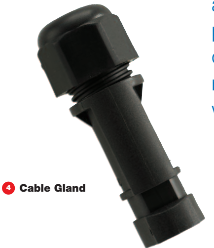
4 Cable Gland

For more information about what Vydyne products can do for you, contact your sales representative or visit us at www.ascendmaterials.com .