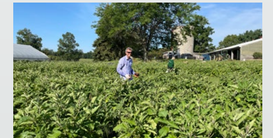
Forgotten Harvest Detroit, MI

Ascend Cares Shanghai visited the Elderly Daycare Center in Shanghai to be an encouragement to the residents. Volunteers spent time connecting with new friends, playing games, and making rice dumplings and sachets.