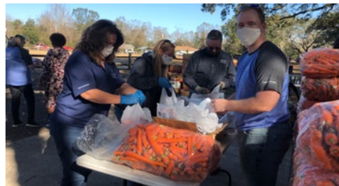
Cantonment Improvement Committee Pensacola, FL

Being connected to our communities means we know many families struggle to put food on the table. Every week, Ascend Cares Pensacola and the Cantonment Improvement Committee partnered together at Carver Park to unload, fill bags and distribute food to those in need.