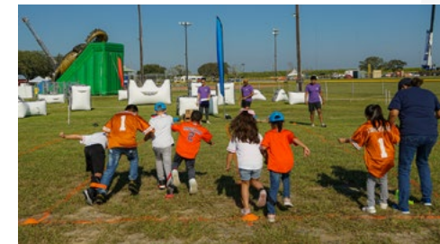
Kidz Harbor Chocolate Bayou, TX

Ascend Cares Decatur and Turner Industries joined Sleep in Heavenly Peace to build beds for children who previously were sleeping on the floor. In one day, volunteers built more than 100 beds for children in the Hartselle, Alabama area.