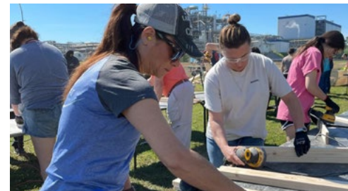
Sleep in Heavenly Peace Decatur, AL

As their signature key partner project, Ascend Cares Greenwood donated $26,400 to the Ninety Six Primary School to build an outdoor classroom. For months, volunteers worked at the school to paint and assemble interactive panels and tables. The outdoor classroom gives the school a new, fun space to keep students connected to outside learning.