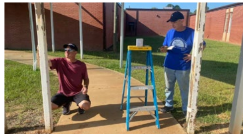
Ninety Six Primary School Greenwood, SC

Being connected to our communities means we know many families struggle to put food on the table. Every week, Ascend Cares Pensacola and the Cantonment Improvement Committee partnered together at Carver Park to unload, fill bags and distribute food to those in need.