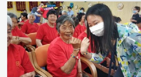
Elderly Daycare Center Shanghai, China

Kidz Harbor offers medical, physical, educational and psychological assistance to abused and abandoned children, and our Chocolate Bayou site has been a faithful supporter of this work in many ways for years. The site hosted a fun field day with games, awards, great food and lots of smiles for 50 children.